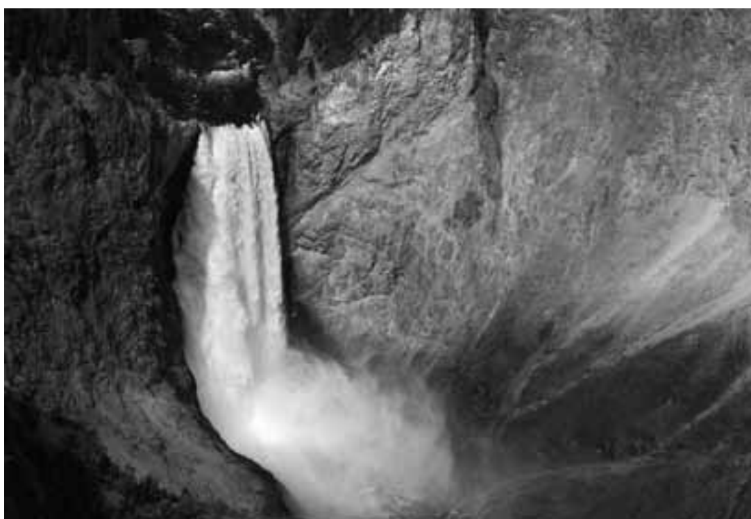
Aerial view of Lower Falls in the Grand Canyon of the Yellowstone River