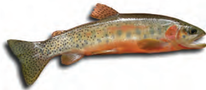
Westslope cutthroat trout ( Oncorhynchus clarkii lewisi ).

Two subspecies of cutthroat trout are found in Yellowstone: the westslope cutthroat and the Yellowstone cutthroat (which has both large- and finespotted varieties).