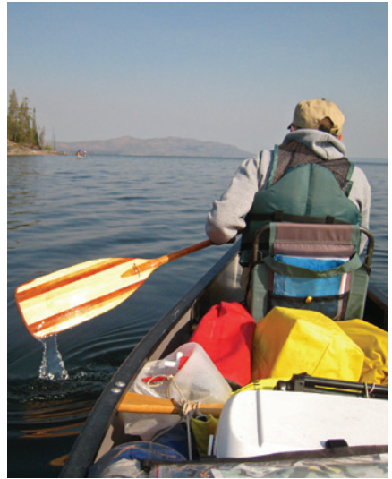
All vessels require a permit.

Dispose of fish and/or fish entrails within the waters where the fish