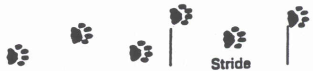
The method of measuring stride shown on a bobcat trail.

A _____ Claw Length B _____ Pad Length C _____ Pad Width